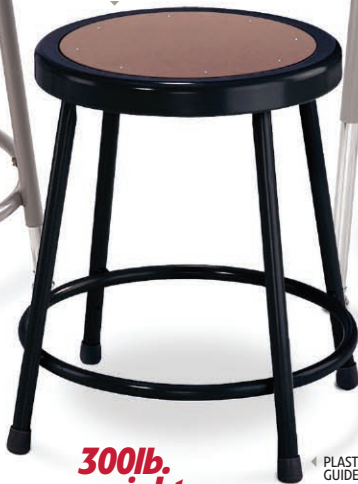
MODEL 6218 SHOWN