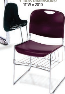
MODEL 8508 W/TAB5R AND BR85 The 8500 Series chair with the optional R/L Tablet and Book Rack