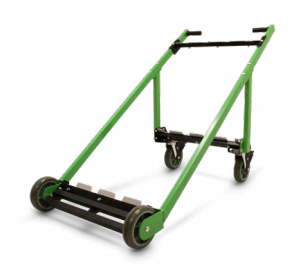
XPRESSPORT 31" WIDE CART HOLDS 8 TABLES

Our lightweight, easy-rolling XpressPort carts or Mitylite Carts are the perfect partners to get our ABSI tables where they need to go quickly and extend the life of the table.