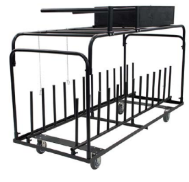
CT/RT CART 24 KNOCK-DOWN HOLDS 24 TABLES