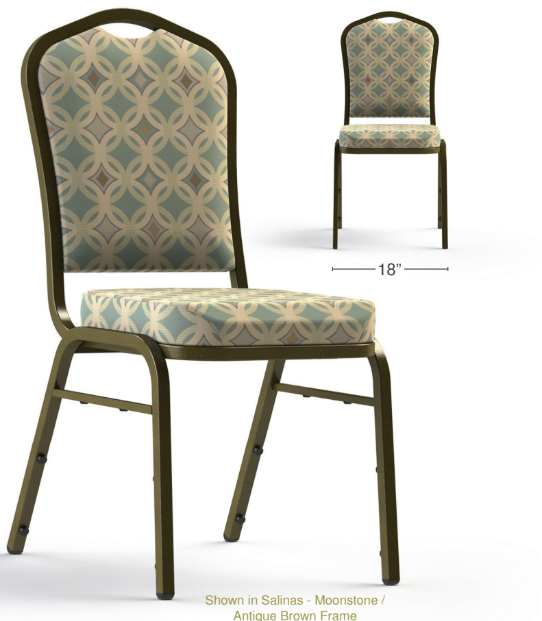
Shown in Salinas - Moonstone / Antique Brown Frame