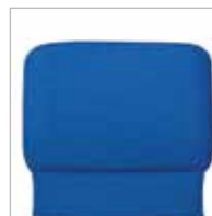
PASSIVE LUMBAR (Standard)