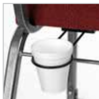
COFFEE CUP HOLDER