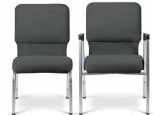
20-in Seat (Standard)