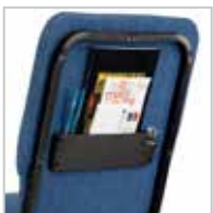
CARD AND CUP HOLDER