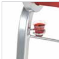
COMMUNION CUP HOLDER