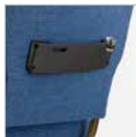
CARD AND CUP HOLDER