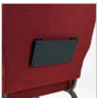
PENCIL / CARD HOLDER