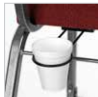
COFFEE CUP HOLDER