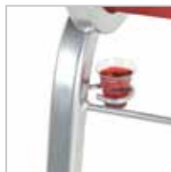
COMMUNION CUP HOLDER